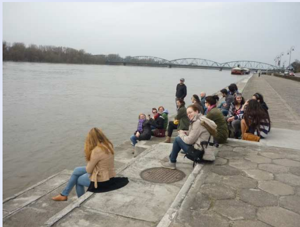
At the Vistula river (Wisła) in Toruń